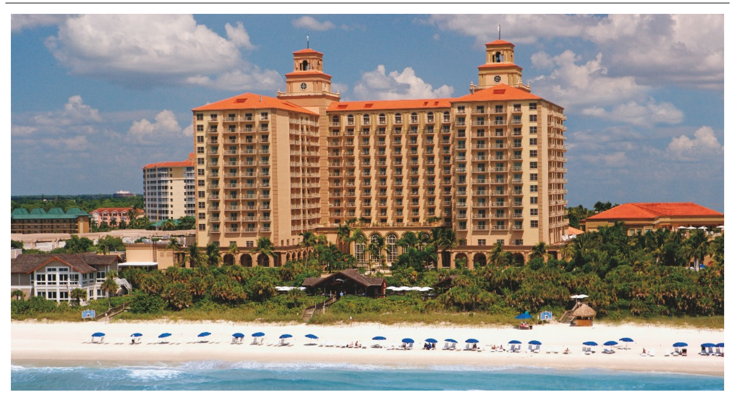
53rd Annual Meeting 🌣 October 26-29, 2022 🌣 Ritz-Carlton Naples 🌣 Naples, FL