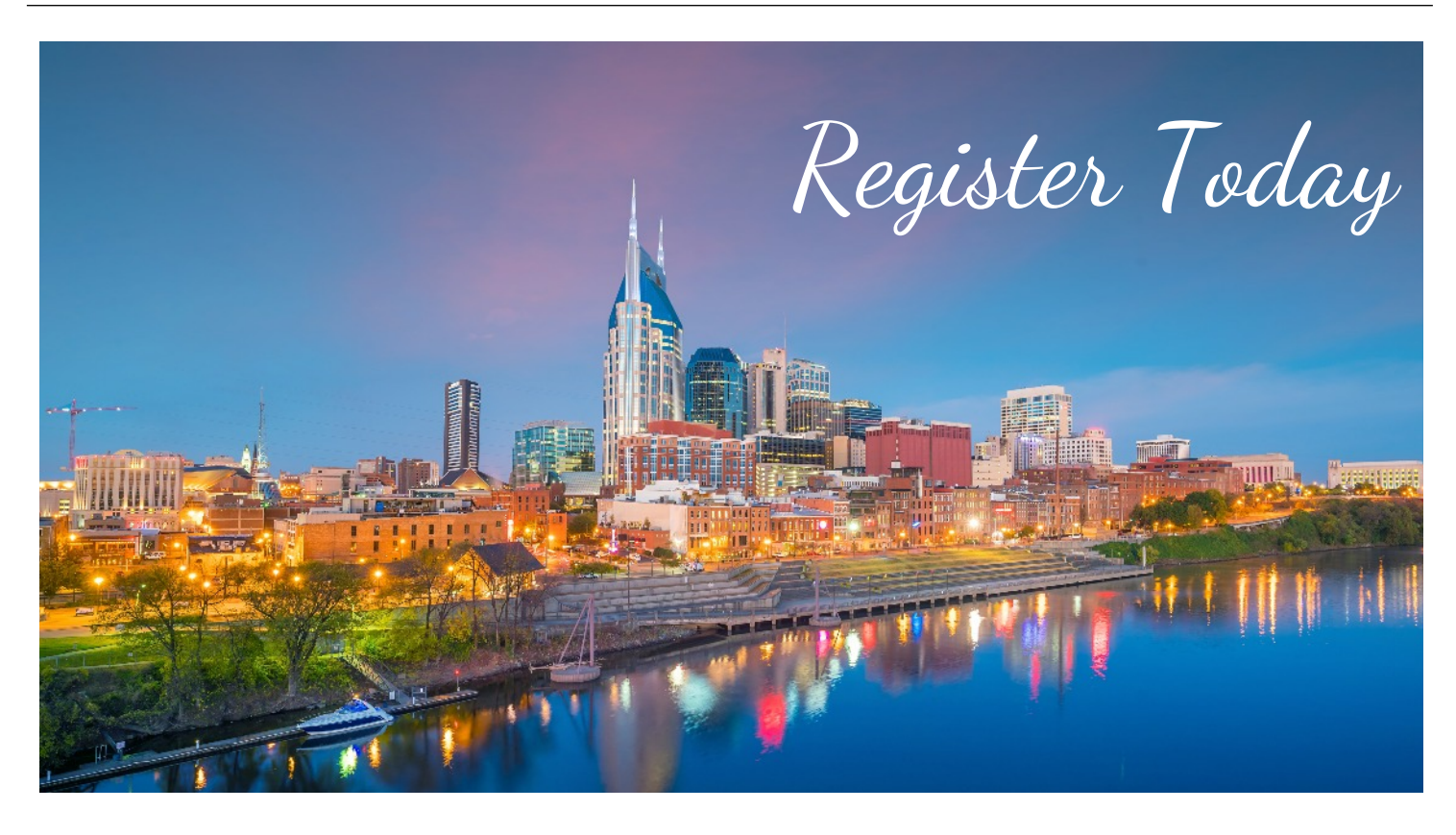
52nd Annual Meeting ☐ October 20-23, 2021 ☐ Omni Nashville Hotel ☐ Nashville, TN