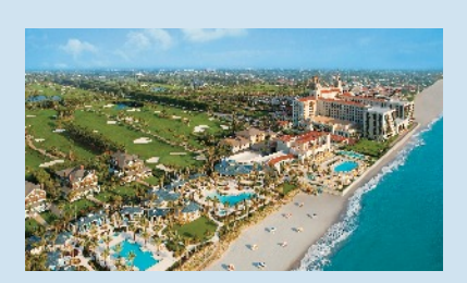
50th Annual Meeting October 16-19, 2019 The Breakers Palm Beach, FL