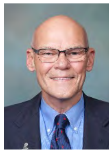
James Carville New Orleans, LA

James Carville Looks at Politics and the 2016 Race for the White House Friday, 9:20 am