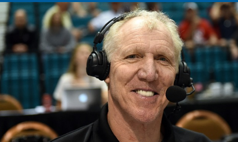
EOEF PRESIDENTIAL GUEST SPEAKER Bill Walton